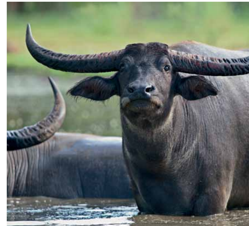
CLOCKWISE FROM TOP: Picnic in a billabong | Piknik di billabong; The 4WD vehicle is standard in the outback | Kendaraan 4WD adalah alat transportasi standar di outback; Water buffalo are drawn to the floodplains to feed | Kerbau-kerbau air mencari makan di floodplain; John pilots one of the airboats | John mengendarai salah satu airboat.