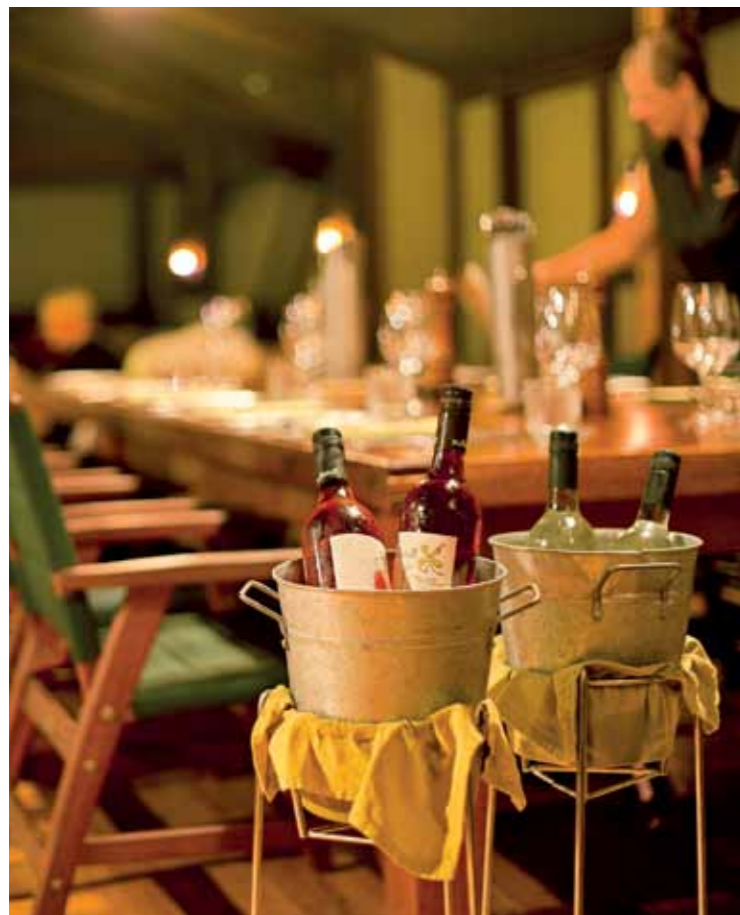
FROM LEFT: Wild landscapes meet fine dining at Bamarru | Kombinasi alam liar dan fine dining di Bamarru; A water lily blooms | Bunga teratai merekah.